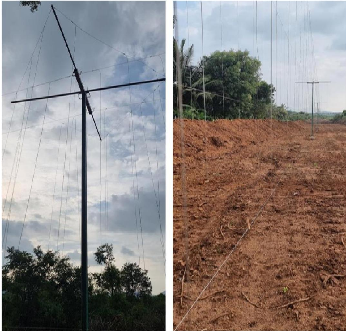
(Reference photographs — T-frame mast detail and installed fence alignment in the field)